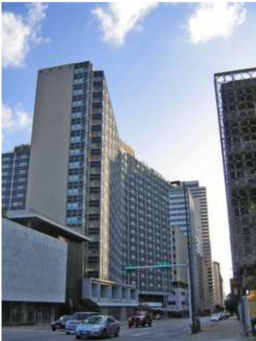
The Dallas "Grand"

When the Statler Hilton opened in downtown Dallas in 1956, it was hailed as the most modern hotel in the country. Its sheer size, bold form and innovative architectural features soon made it an icon of mid-20th-century design. Today, the building, once considered the crown jewel of the Hilton hotels, sits vacant. Located on an increasingly attractive piece of real estate, the Statler Hilton faces an uncertain future as encroaching development pressure heightens the threat of demolition.